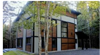
Le Plein Nord

Selling price : 660 000 $ Annual income : 85 000 $