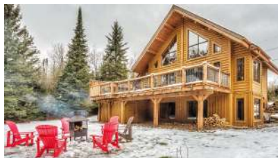
Le Mont-Tremblant 1

Selling price : 805 000 $ Annual income : 100 000 $