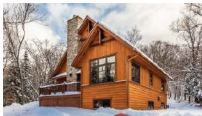
Le Mont Blanc

Selling price : 685 000 $ Annual income : 92 000 $